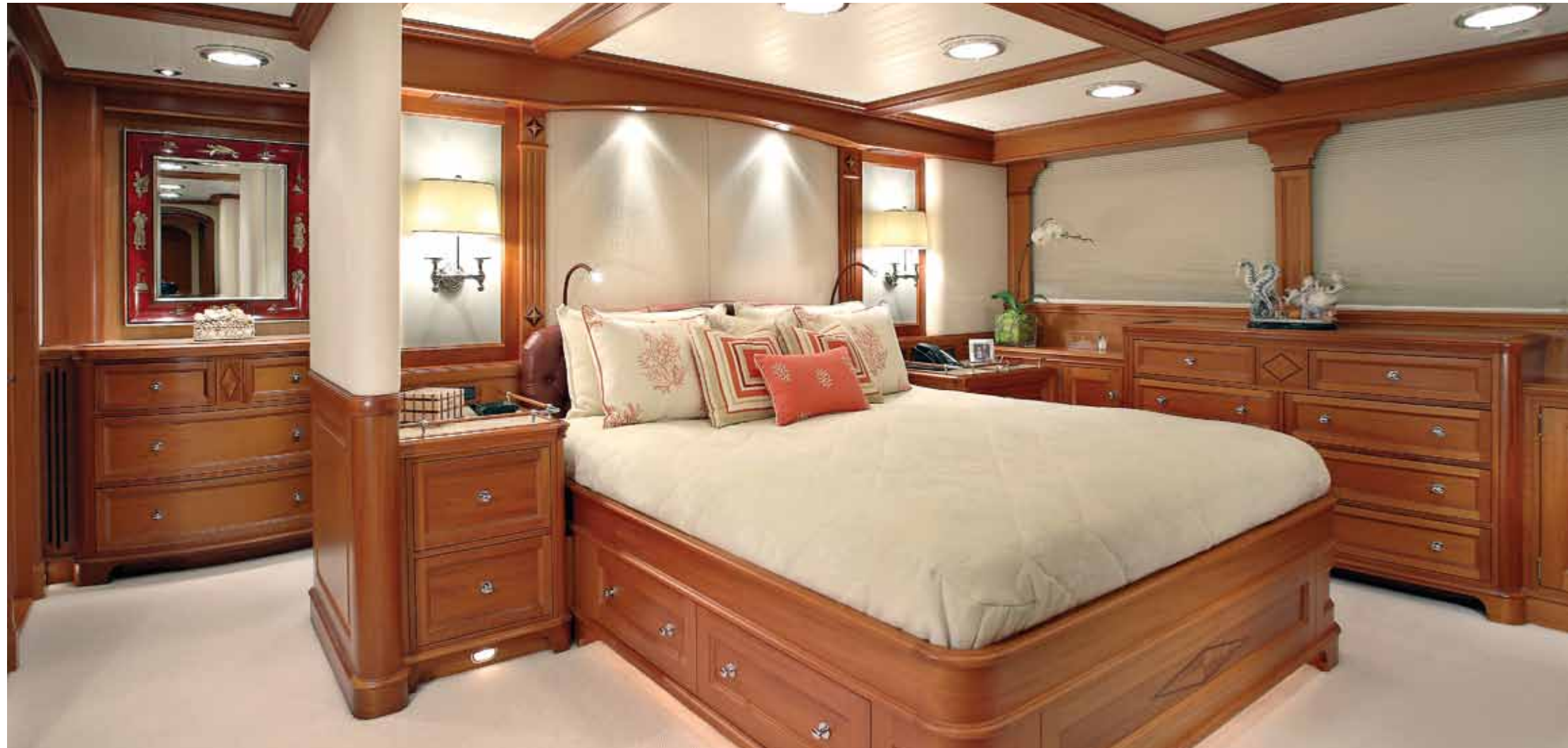
THE SETZER INTERIOR