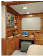
Traditional, sailing-inspired touches are found throughout, including mahogany and white-planked overheads.

forward chart table. Above the observation banquette, a curved, rear glass panel (another Setzer innovation) grants a clear view aft through the skylounge. For night running, the glass is closed off by panels that blend perfectly into the stairwell curve. A substantial overhang shields from sub-equatorial downpours and also helps keep the wheelhouse cool. Aft views are enhanced through curved, glass side windows adjacent to the pilothouse doors.