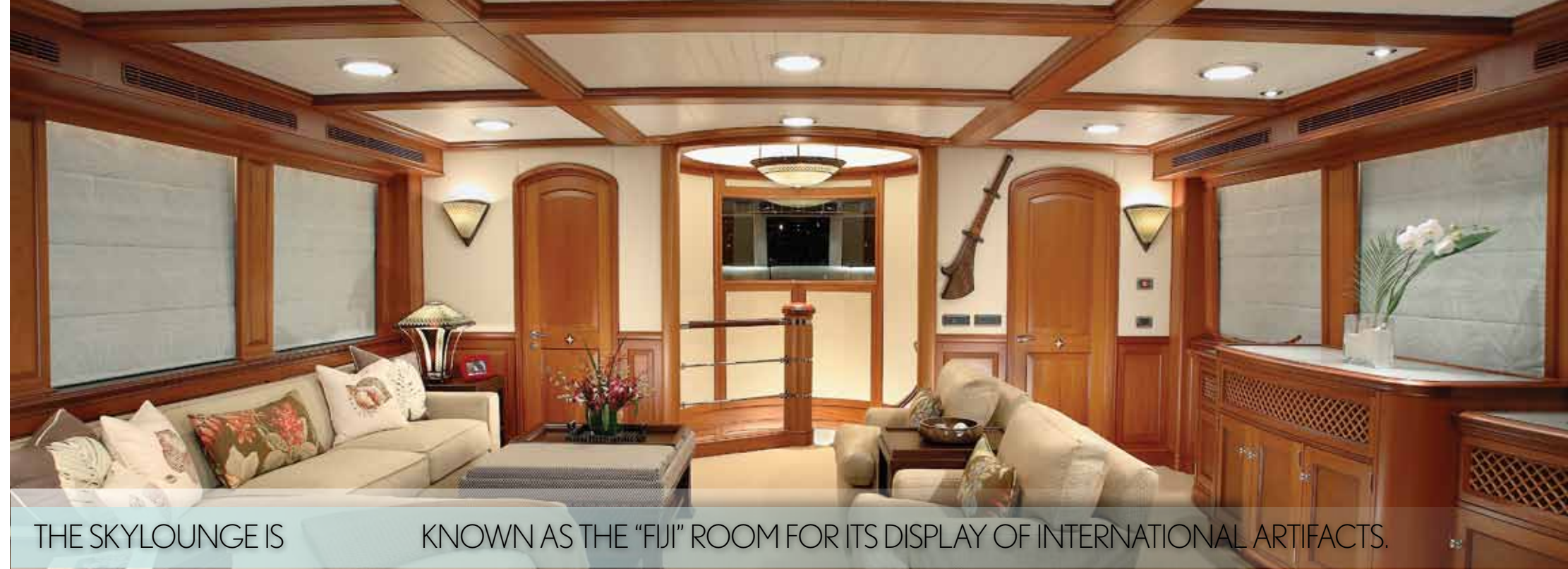
THE SKYLOUNGE IS KNOWN AS THE “FIJI” ROOM FOR ITS DISPLAY OF INTERNATIONAL ARTIFACTS.