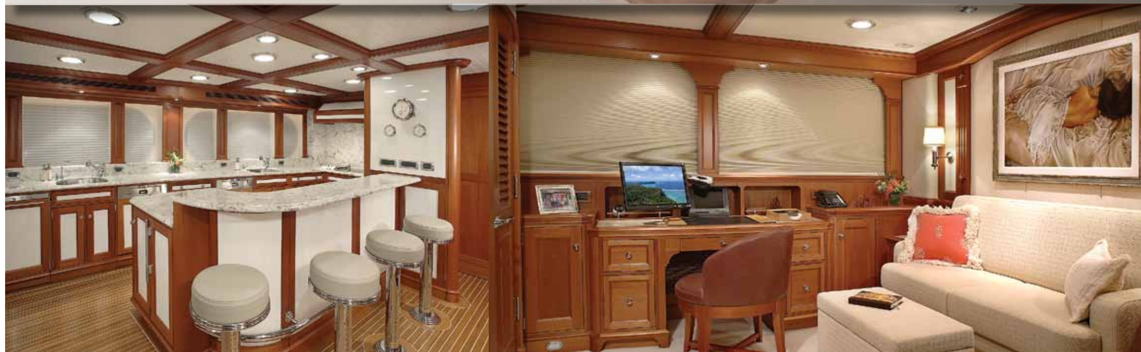
BENEFITS FROM CLEAN LINES AND NEUTRAL COLORS CREATING A SENSE OF CALM.