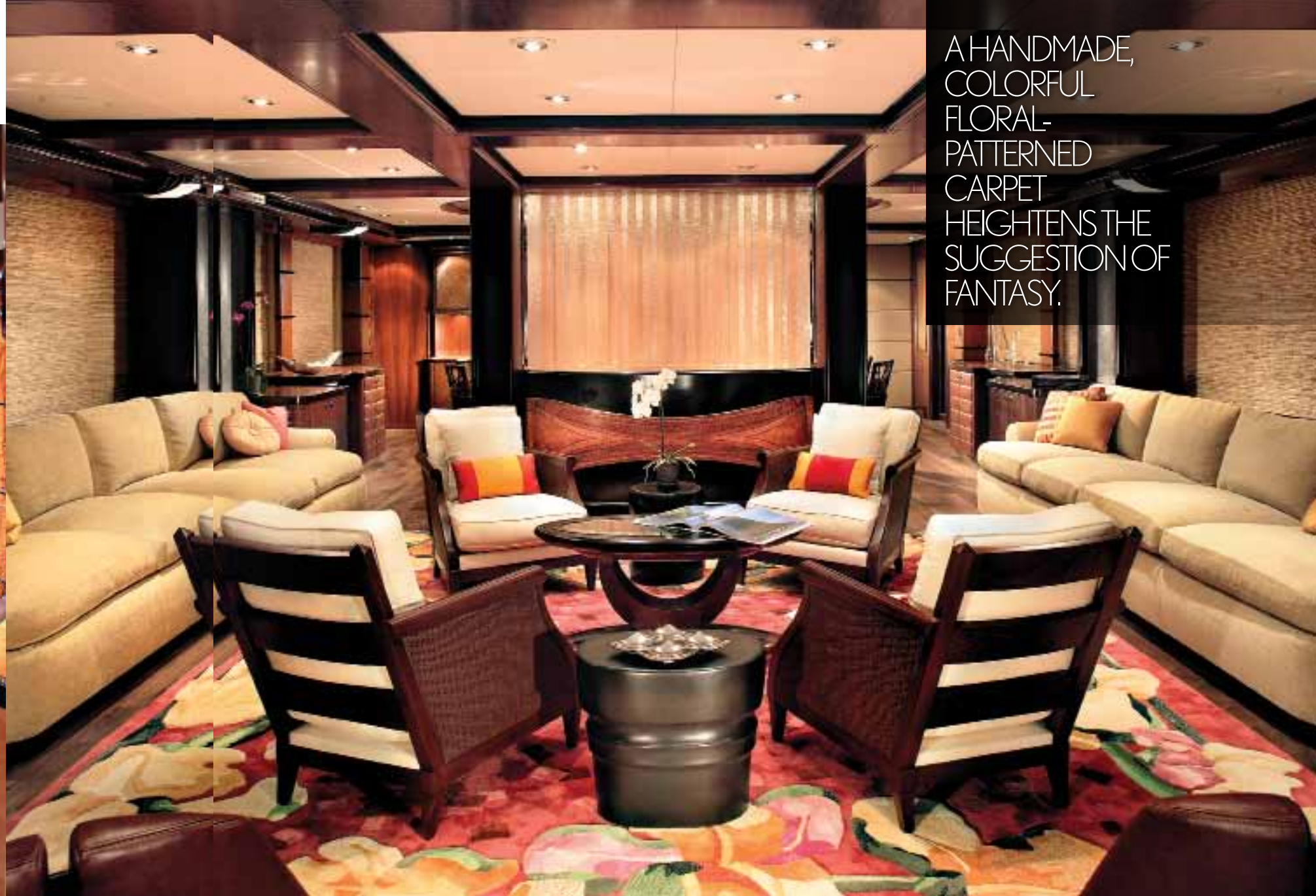
A HANDMADE, COLORFUL FLORAL-PATTERNED CARPET HEIGHTENS THE SUGGESTION OF FANTASY.