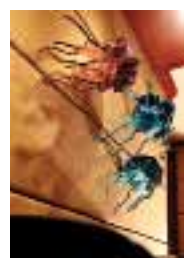
A stained glass skylight, seen through the half-wall of the dramatic ensuite, grants a tremendous sense of space in the master stateroom.

suggestion of fantasy in the conversation area. In the center, two sofas flank the Sutherland teak armchairs that surround a bubinga and wengé pedestal oval coffee table with a beveled glass top. The Polynesian theme is emphasized by bamboo woven window coverings (automatically controlled), while small Art Deco-inspired light fixtures mounted along dark bubinga cornices deliver a cozy, clubby glow.