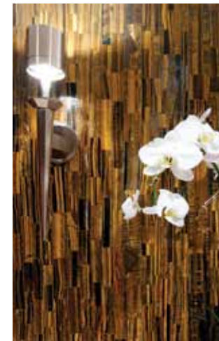
These Pages A blend of fixed and freestanding furniture showcases the African mahogany wood selection and exquisite stonework that is found throughout.

one important raison d'être : to enable the couple and their family to explore the world's most spectacular cruising grounds.