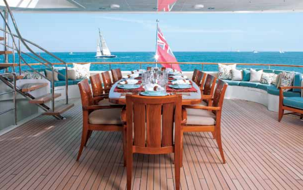
Left The sky lounge aft features yet another dining option for guests. The teal cushions accentuate the red boot stripe and nameplate.