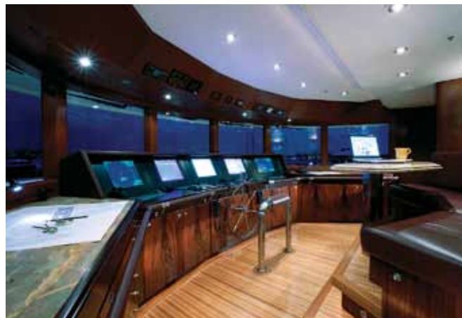
Right Katya boasts a range of more than 5,000nm at 12 knots.