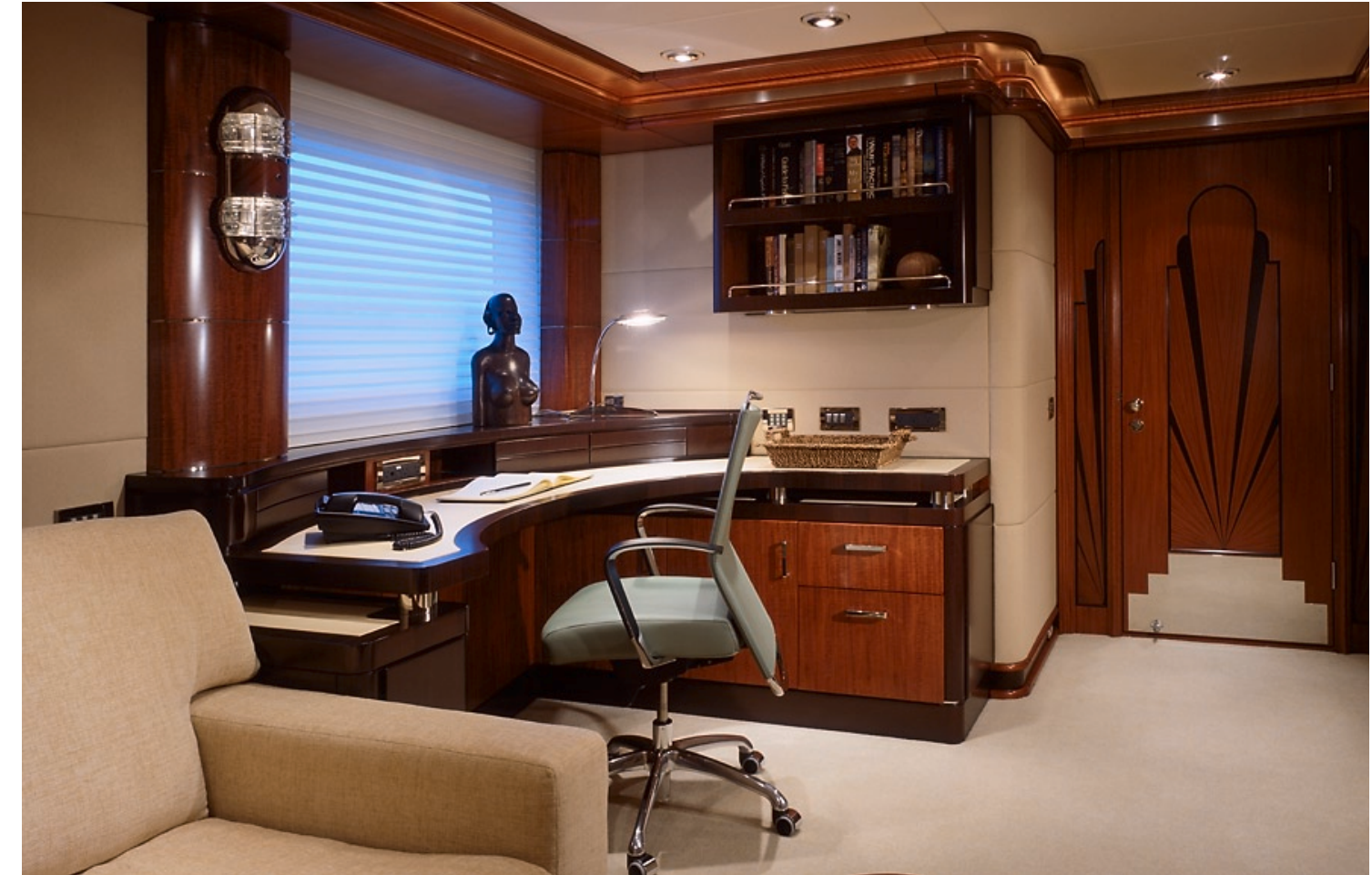
Blend different mahoganies and sumptuous textures. Exquisite details meet the eye at every turn. Master bedroom suite creates a haven, a private retreat. Formal writing desk, lounging area, a place to decompress when the yacht is full.