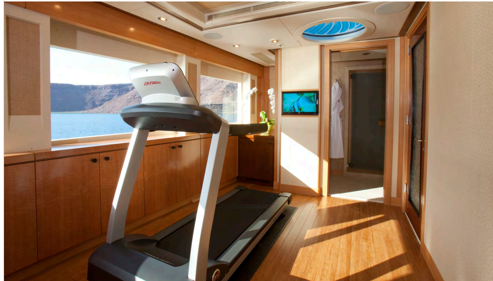
SUNLIGHT ILLUMINES BOTH THE OFFICE AND GYM THROUGH HANDCRAFTED STAINED GLASS SKYLIGHTS AND GENEROUS HULL-SIDE WINDOWS.