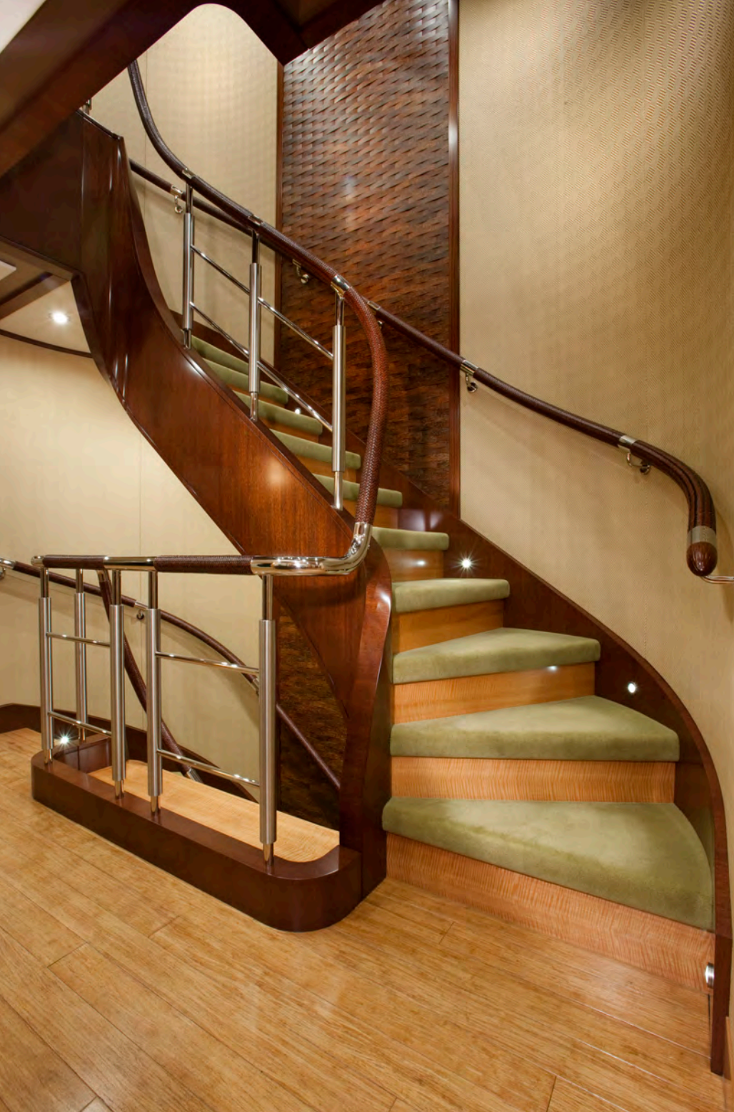
A WORK-OF-ART IN ITSELF, ARIANNA'S OPEN-AIR CONCEPT CENTRAL STAIRCASE CONNECTS ALL FOUR DECKS. WOVEN COCONUT TILES PROVIDE A BASKET-LIKE BACKDROP WITH A CURIOUS NATURAL TEXTURE.

Prime real estate to explore personal indulgences is found on either side of Arianna's main deck. Port side, a fully equipped gym supplies breathtaking ocean views. Its open ambience is enhanced by generous space for free weights, balls, and yoga stretches, and completed with a changing room and day head. A voluminous sauna encourages full submission to this spa-like oasis at sea. Starboard, an expansive, state-of-the-art office enables work in multiple time zones, a must for longer expeditions. Its focal points also include magnificent hull-side windows and an authentic 17th-century German safe, selected and lovingly restored by Arianna's owner.